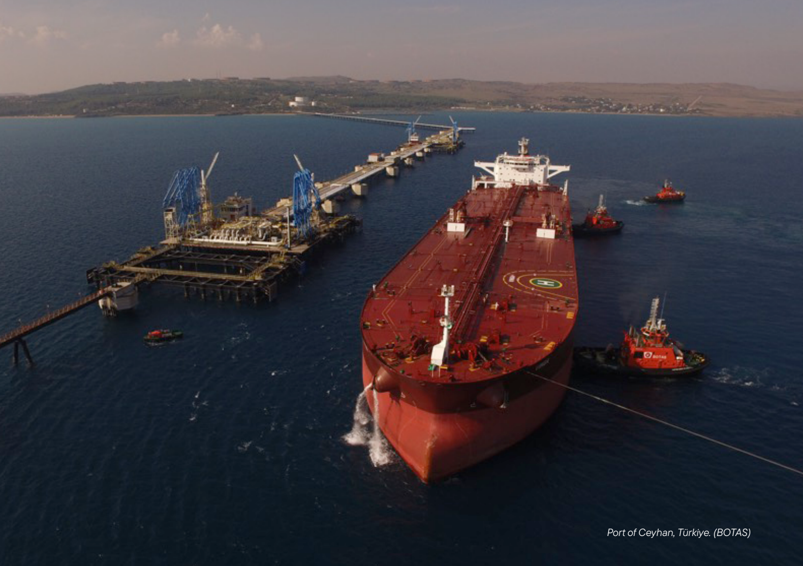
Port of Ceyhan, Türkiye. (BOTAS)